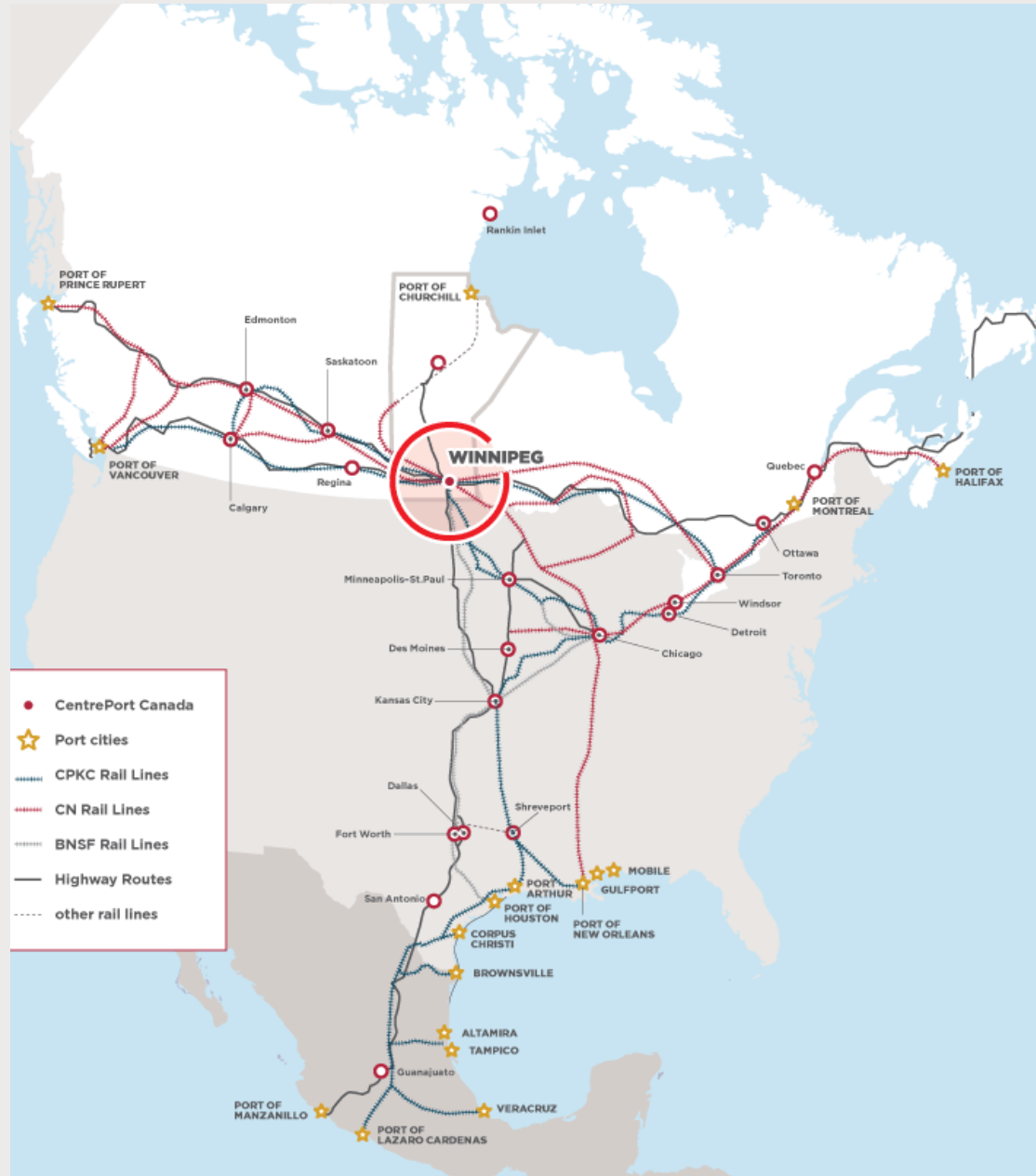
ACCESS TO NORTH AMERICAN MARKETS

Strategically located at the hub of international trading corridors, CentrePort Canada connects businesses to major markets around the globe.